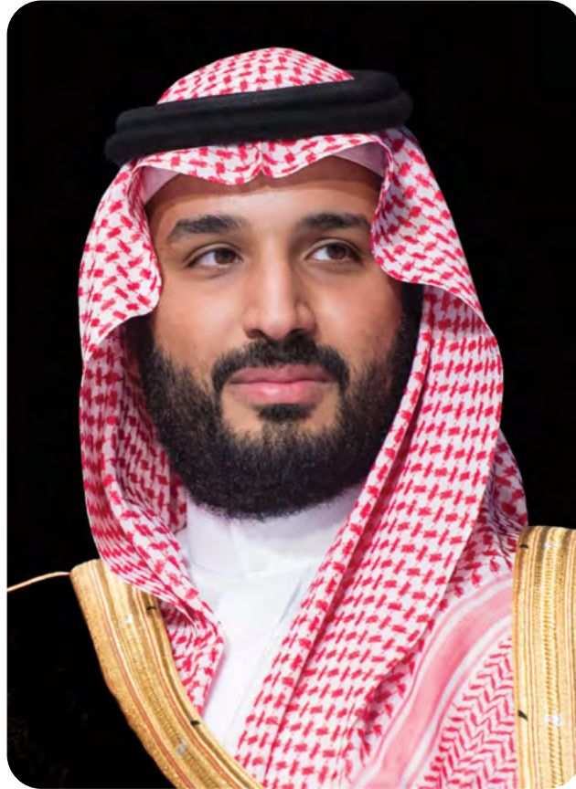
His Royal Highness Prince Mohammad bin Salman bin Abdulaziz Al Saud